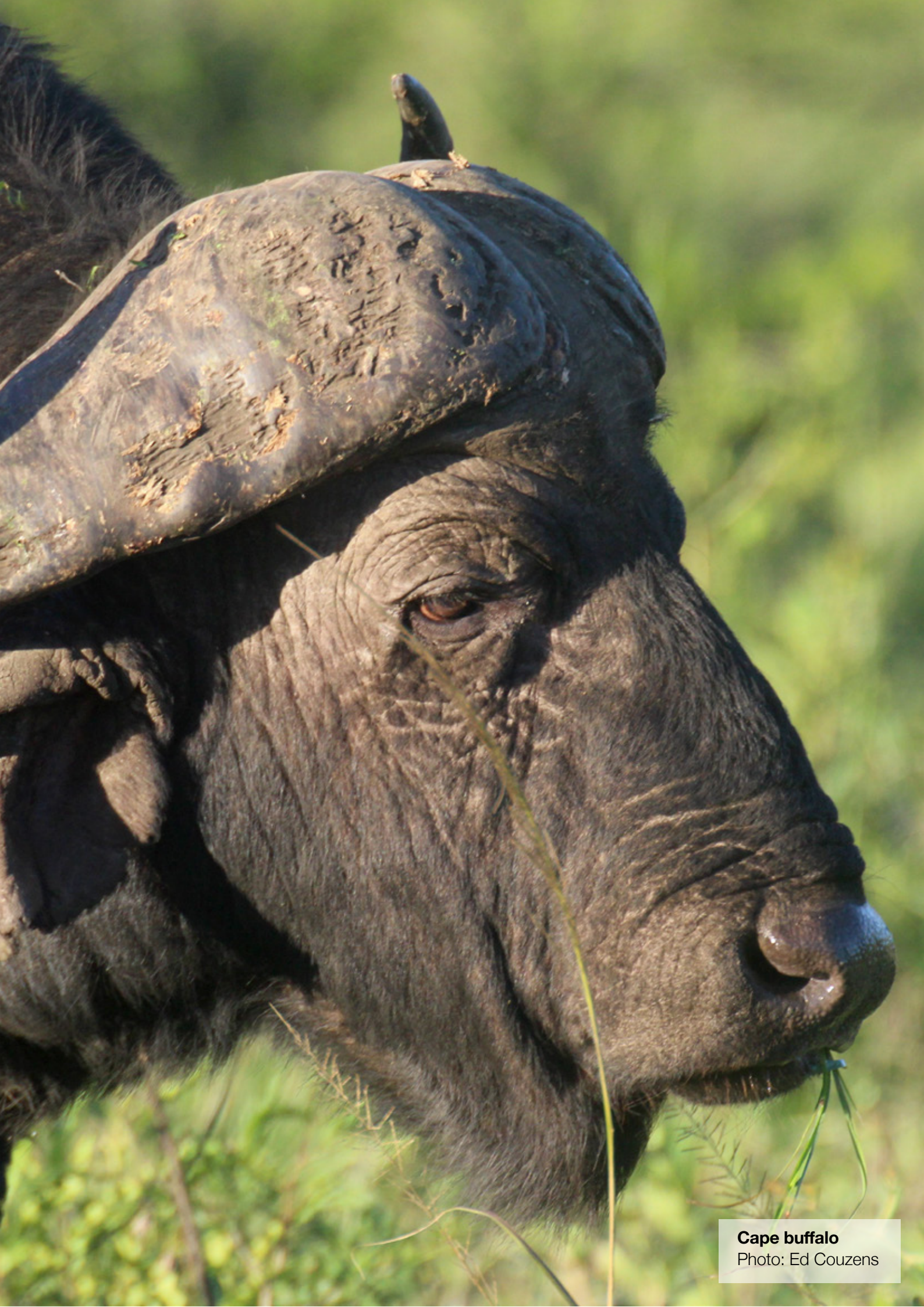
Cape buffalo